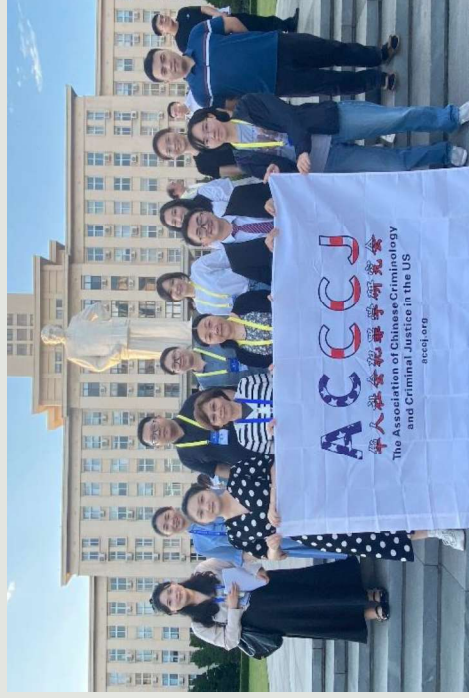
(ACCCJ delegates - Tianjin, China (9 July 2023))

ACCCJ delegates speak at the annual meeting of the Chinese Sociological Association in Tianjin, China on 9 July 2023.